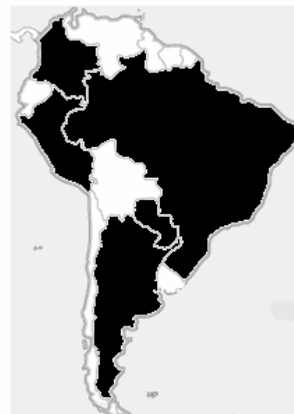
América do Sul Amostra de países